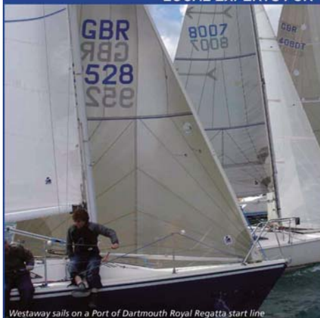
Westaway sails on a Port of Dartmouth Royal Regatta start line

LOCAL EXPERTS FOR YOUR SAIL REQUIREMENTS